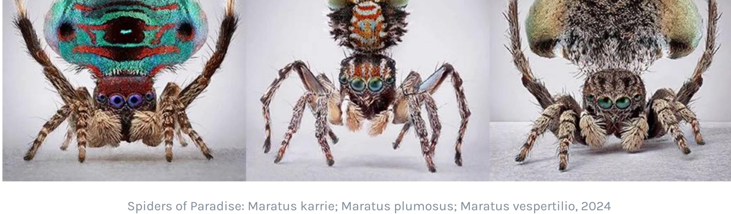
Spiders of Paradise: Maratus karrie; Maratus plumosus; Maratus vespertilio, 2024

"The Maratus spiders of Australia are the most colourful, flamboyant, sexy, and charming spiders on the planet. To me, their use of colour, gesture, sound and movement makes them sophisticated visual and performing artists. They are also the smallest performers I know of, on average about 3–5mm in size, smaller than a grain of rice."