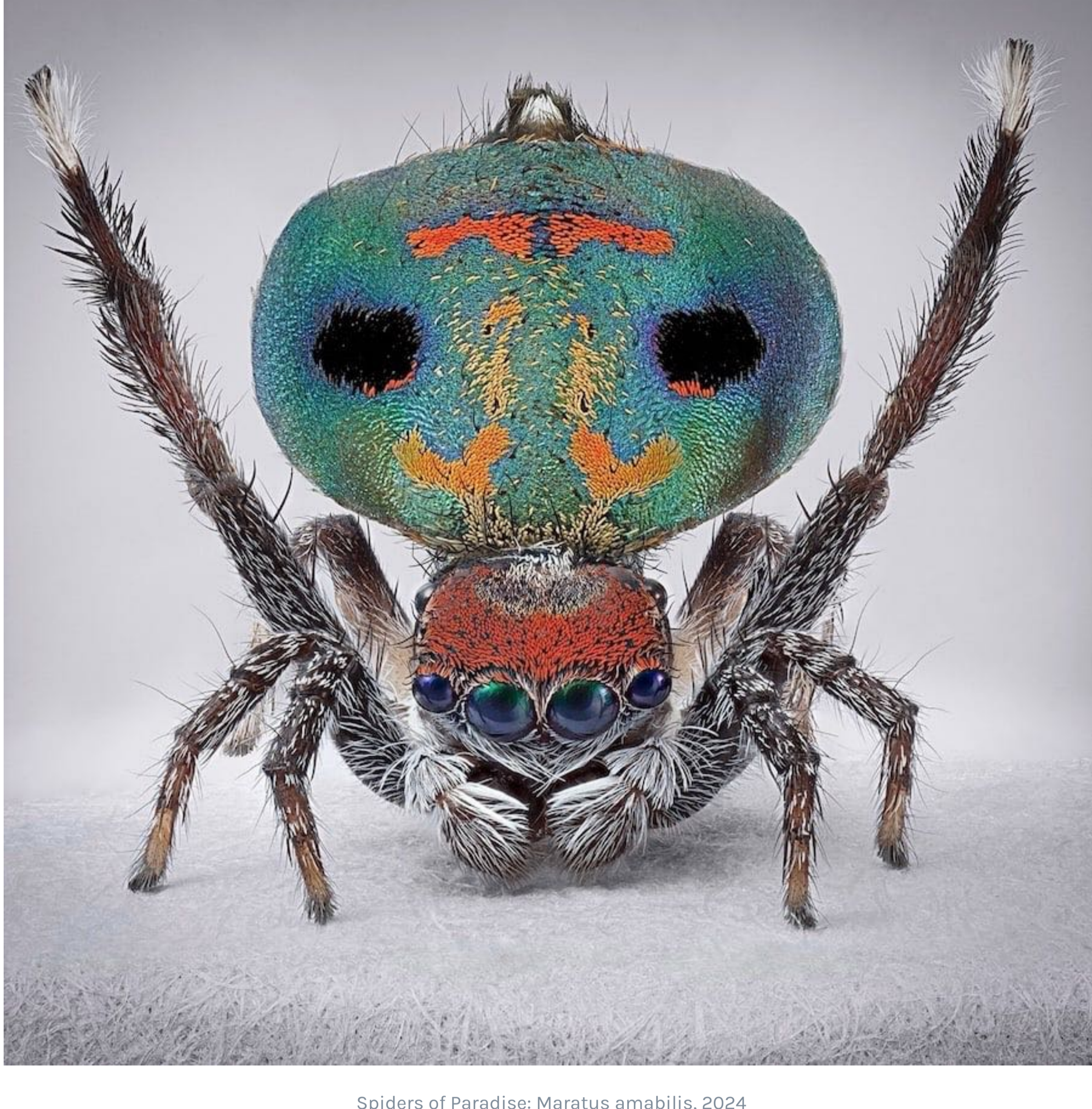
Spiders of Paradise: Maratus amabilis, 2024

"I think if paradise existed, it would be inhabited by beautiful creatures such as these."