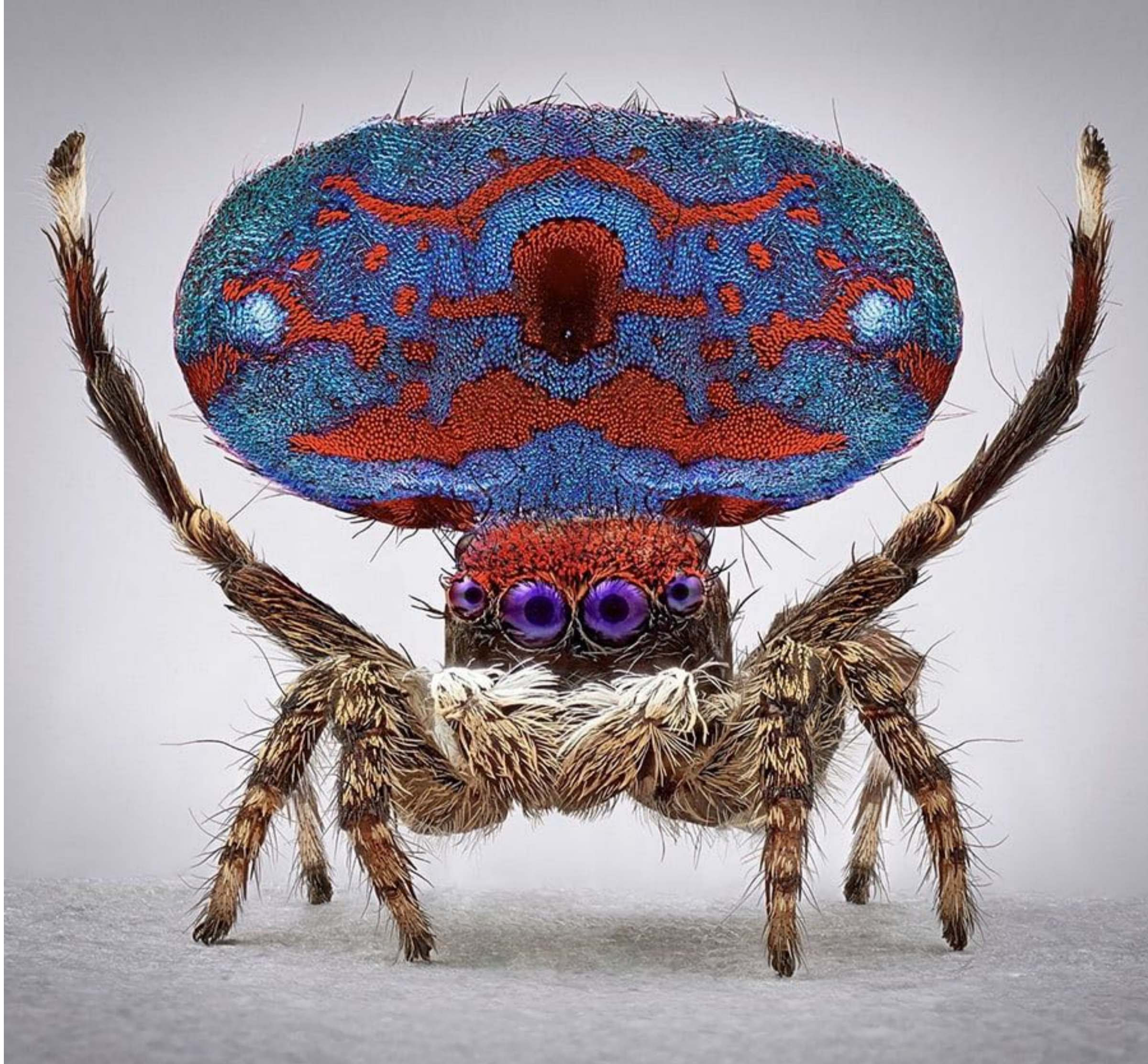
Spiders of Paradise: Maratus madelineae, 2024

"The male has to try extremely hard (both in visual communication as well as in charm and perseverance) to be 'chosen' by her. She exercises her right to choose, and drives him to display an excess of vibrant colour and performance virtuosity in a complex courtship ritual."