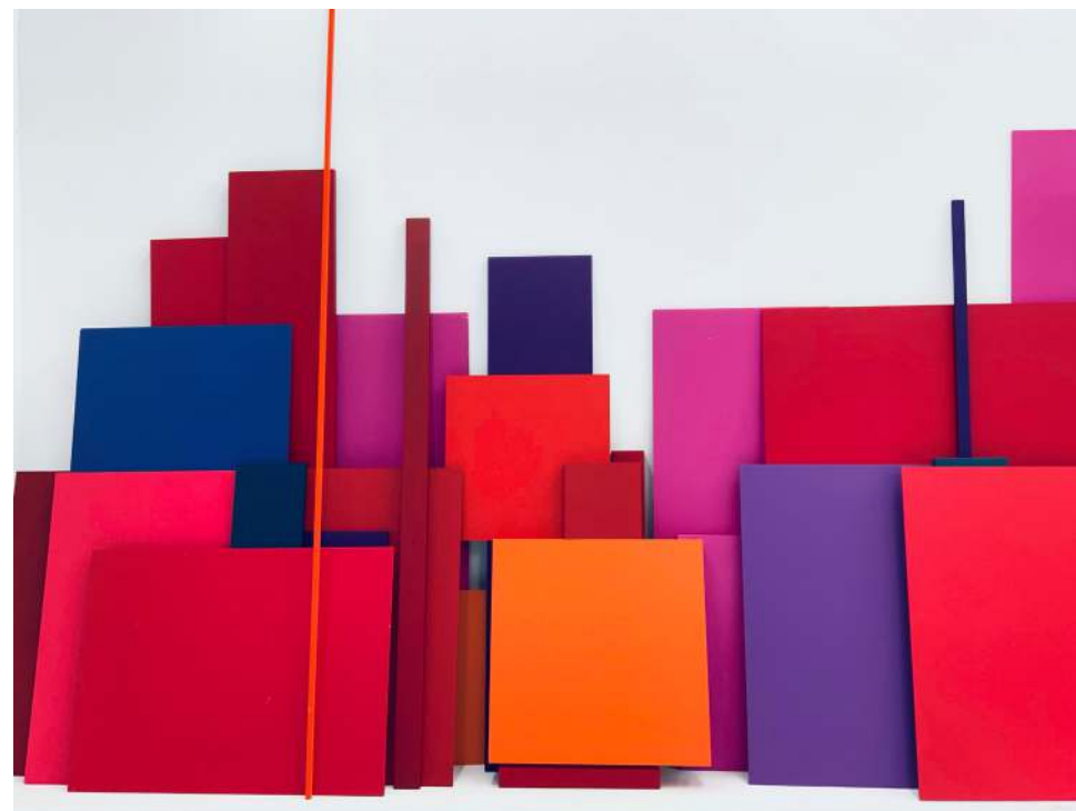
Metropolis , 2022. Paint, wood, MDF, studio view, Blue Mountains, various dimensions.