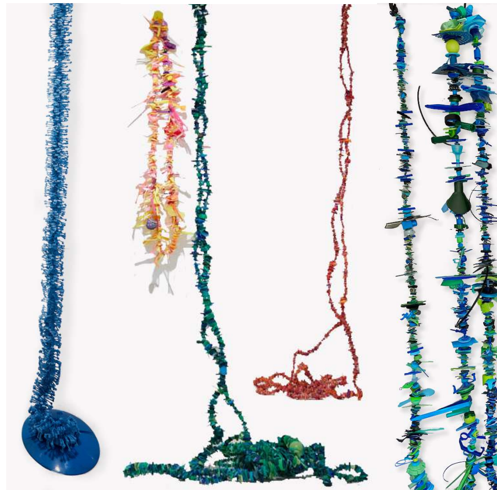
Gleaning for plastics: From the beach and beyond, 2022. Plastic, various dimensions.

BIO "My art practice focuses on concepts of consumption and waste. The bundles and sculptural installations I make derive from the plastic detritus I collect from my local Bondi Beach and nearby Rose Bay. Sometimes plastics are accessed from other sources too—like pristine tamper-proof aviation seals or construction industry cable ties. The process of collecting begins with gleaning, often solo, and sometimes with local volunteer clean-up groups, along nearby coastlines. This gleaning is followed by the cleaning and sorting of the plastics by colour and size which is a fastidious process, as is the jewellery-like threading of the components onto wire threads that follows. When completed, these works stand in stark contrast to the ease of disposability associated with the materials that arrive on our shorelines or accumulate as landfill, evidence of our collective human neglect and destruction of the environment that sustains us".