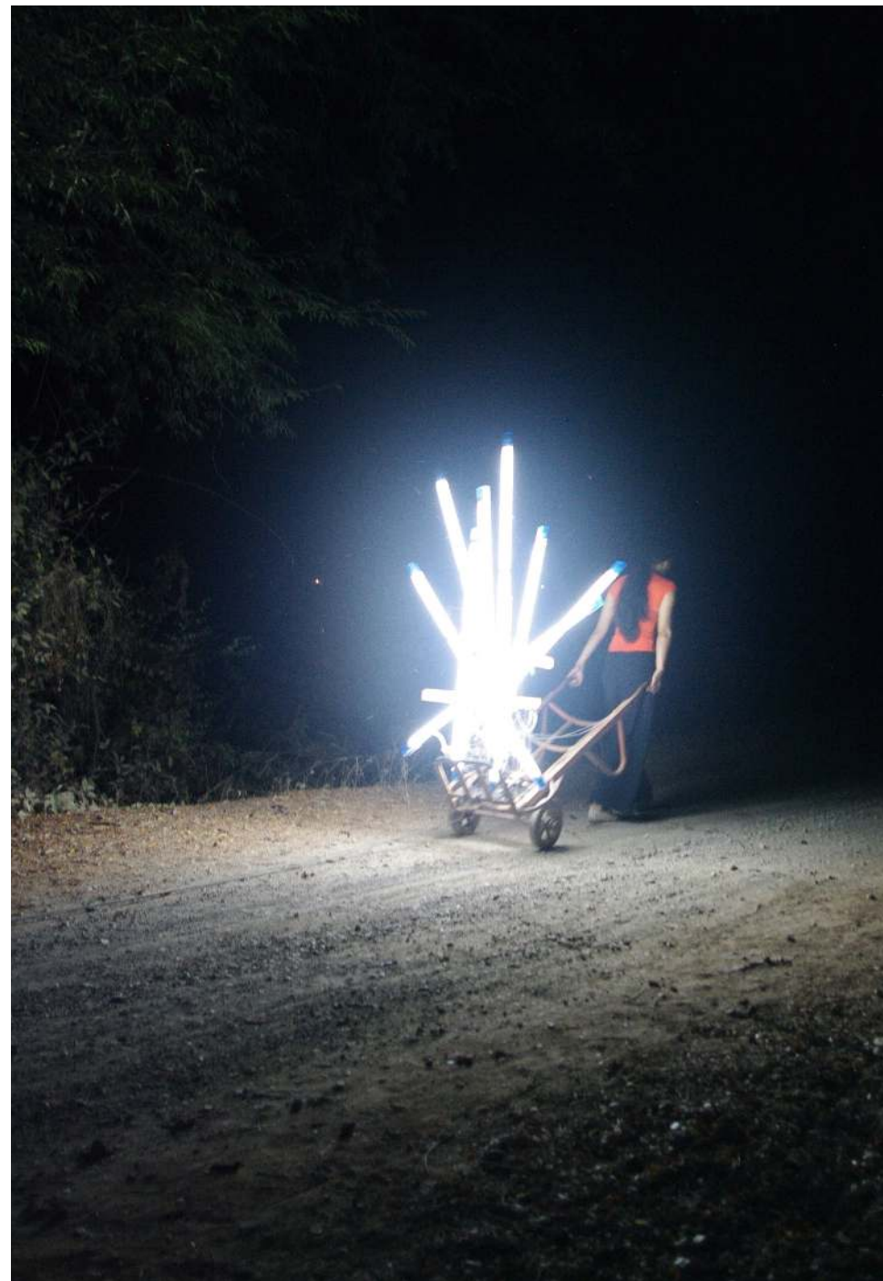
Star on the Earth , 2016. Performance, Bangkok, Thailand, single-channel video, 6min 11s.

Wenmin Tong was assisted by ARTNOVA 100, Beijing Mingtai Culture & Art.