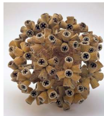
Gumnut Sphere EFGC-GCS , 2021. E. Fowlers gap gumnuts, seeds, rubber, monster clay, sand, metal and metal plinth, 13.5x13.5x13 cm.