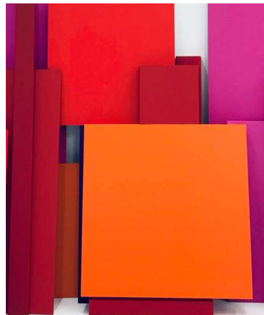
Detail of Metropolis , 2022