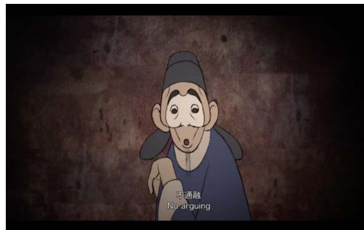
Sacrifice at Guangsheng Temple, 2018-19. Digital drawings, 9min 28s.