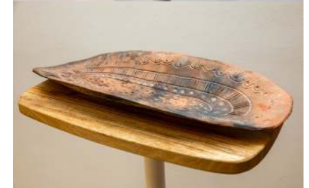
Boomalli Founding Members Coolamons, 2012. Ceramic, ten parts, glazed, unglazed & hand painted, various dimensions.