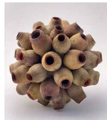
Large gumnut sphere CCGS , 2021. Corymbia calophylla gumnuts, seeds, rubber, monster clay, metal and concrete plinth, 12x12x12 cm.